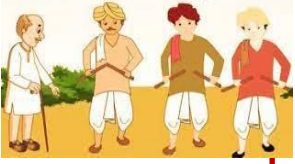
"Unity is Strength"