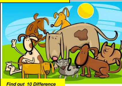
Find out 10 Difference